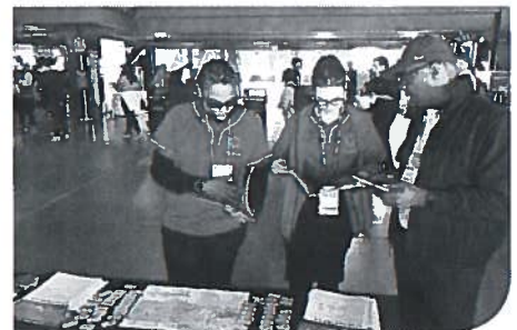
Port of Seattle community outreach